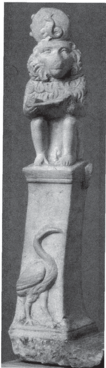
Thoth as baboon with scroll with snake (Agathos Daimon) on his head, and as ibis, 1st century AD. Allard Pierson Museum, Amsterdam.