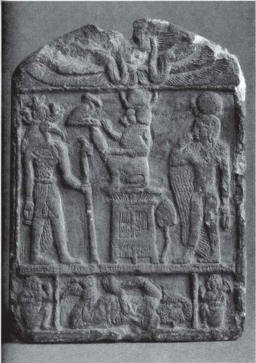
Stele with Thoth as baboon, ibis and ibis-man, 1st century AD. Allard Pierson Museum, Amsterdam.