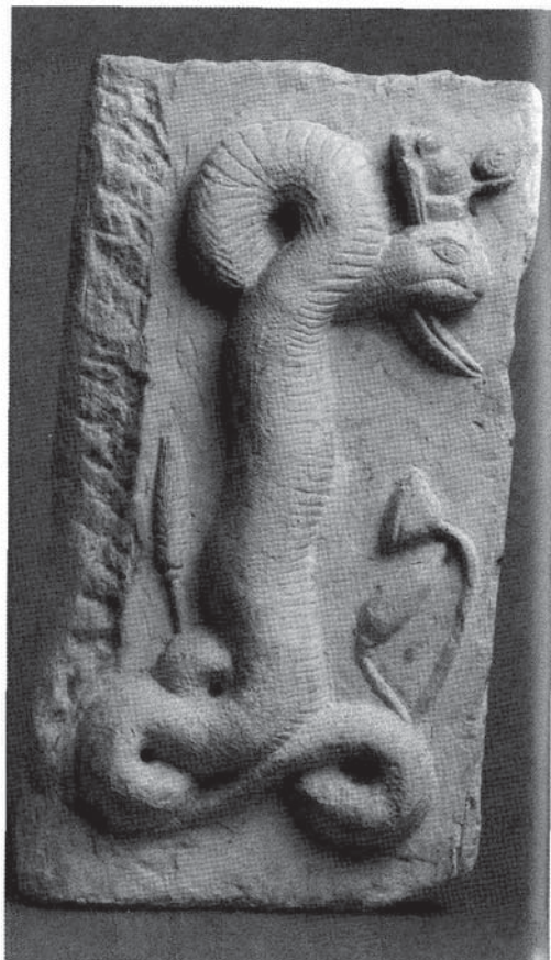
Alexandrian stele with snake as Agathos Daimon, 332-50 BC. Allard Pierson Museum, Amsterdam.