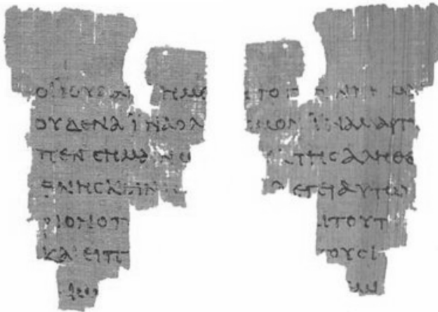
The oldest “manuscript” of the Gospel of John, Fragment P52 (actual size is 3.5” x 2.5”) Left: recto (front) Right: verso (back) Only a single word is actually intact: kai (“and”).

Metzger saves a tiny scrap of John’s Gospel, the Rylands Library Papyrus P52, for last. Even though P52 is the earliest piece of any book of the New Testament we have, it is so tiny we can scarcely make any pronouncements on just what its text says or how much it matches our Gospel of John – the entire text could sit upon a credit card and contains no complete sentences, and only one complete word (see below). Besides which, P52 only goes back to some uncertain point in the mid-second century c. 150 C.E., possibly even later. Scraps like this are not datable any more precisely than a 75 year window. Carbon dating is not accurate enough, so we can only judge by the script style, and we can’t say precisely when a particular script style was in fashion. 28